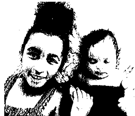
Daughter of Austus & Lynna.